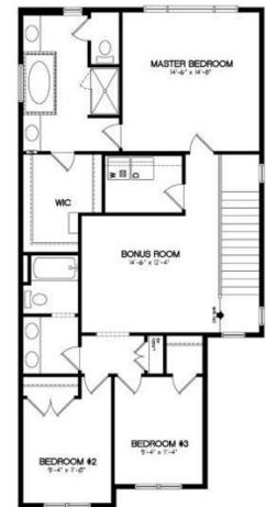
UPPER FLOOR - 1170 SQFT