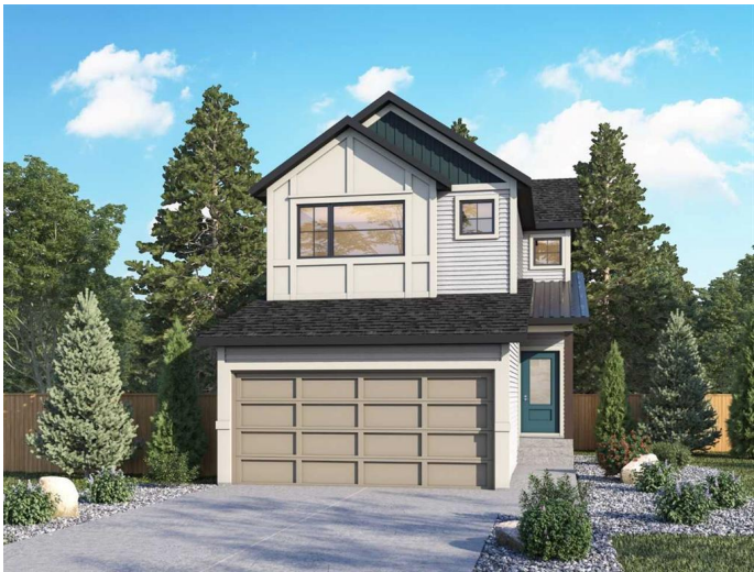
56 Fireside Common

Introducing the Montay by Genesis Builder Group—a thoughtfully designed two-story home featuring 4 spacious bedrooms and 2.5 bathrooms. With a striking open-to-above foyer, this home welcomes you into an open-concept main floor that blends style and functionality. The great room offers a cozy fireplace with a mantle, perfect for relaxing evenings, while the kitchen impresses with a central island ideal for entertaining. A sleek railing guides you to the upper floor, where you™ll find a versatile bonus room and the convenience of an upstairs laundry. The home also includes a double attached garage, 9-foot basement ceilings, a side entry, and basement rough-ins, offering incredible potential for future development. Photos are representative.